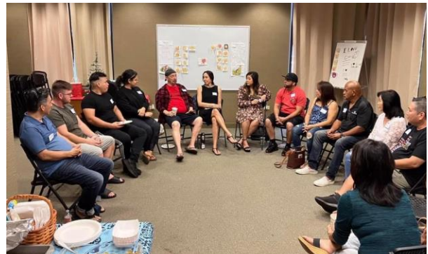
Coffee with the Pastors, January 20, 2024

We live by God's Word We are created to worship. With God, all things are possible. Prayer is the difference. We are family and enjoy community. We are called to make impact. We are generous like our Father.