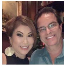
God is Faithful! TC Vegas October 23, 2022

These things I have spoken to you, that my joy may be in you, and that your joy may be full. (John 15:11 ESV)