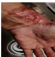
2 nd degree burn

The enemy knows that the Lord honors mustard seed-sized faith , so he comes to steal, kill, and destroy your internal capacity to hope.