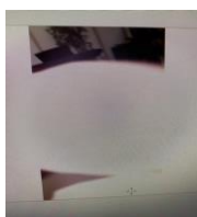
Holy Spirit light